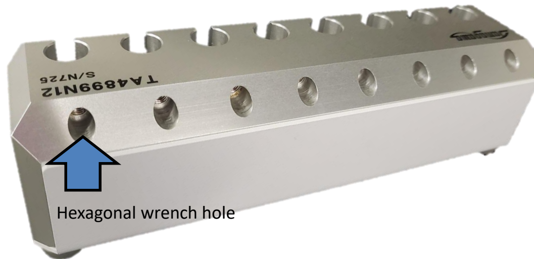
Hexagonal wrench hole

If the magnetic stand does not match the tube you are using, please adjust the ball position using a hex wrench from the hole on the back of the stand.