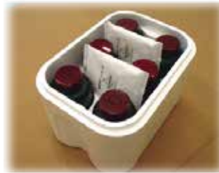
Transport of medical goods and reagents

We can manufacture secondary bag specification.